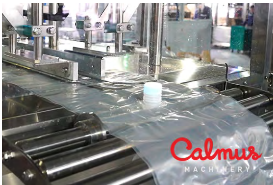
Feeding Empty Bags Continuously